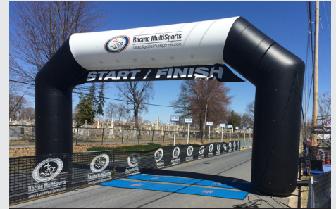
Angled Arch - 35'w x 18'h (25' x 11' clearance inside) One angled arch available