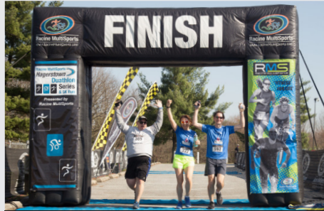
Truss Arch - 16'w x 13'h (10' x 10' clearance inside) Three truss arches available