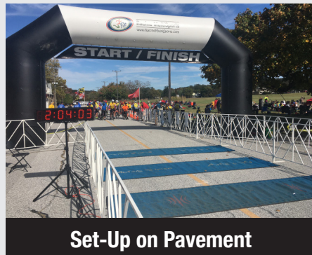
Set-Up on Pavement

Includes curved finish arch, race clock, canopies, chute and 16' feather flags