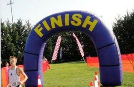
Curved Arch - 14'w x 12'h (9' x 9' clearance inside) One curved arch available

Select from 4 different arch styles for Start, Finish, Transition, custom. You can customize the Arches with your own custom banners.