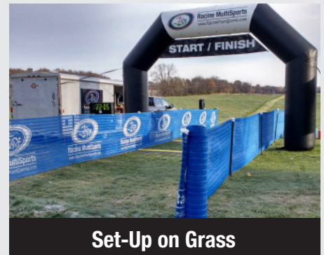
Set-Up on Grass