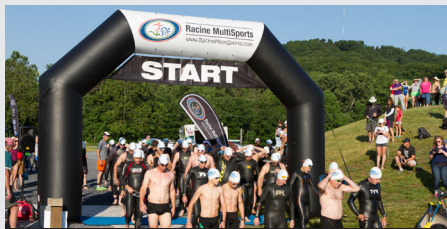
Angled Arch - 22'w x 15'h (16' x 10' clearance inside) One angled arch available